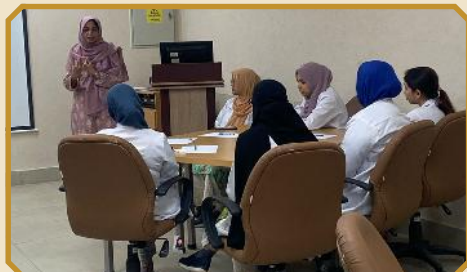
Participants at the training session