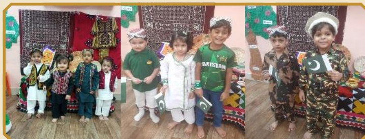
Independence day celebration at baby day care