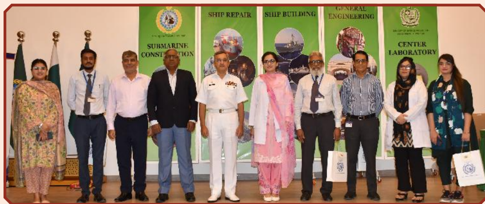
Participants of the session