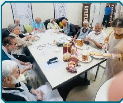
Everyone's hands on deck! Each member actively participating and contributing to the recipe

With sleeves rolled up and smiles on their faces, everyone got involved in the preparation. Some took the lead in assembling layers, while others shared tips, added their own creative twists, or told stories of their favourite childhood recipes. The atmosphere was lively, filled with cheerful chatter and laughter.