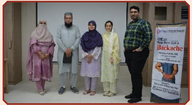
Participants at CME