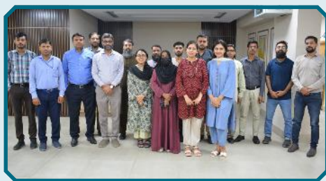
Faculty of Medicine and Allied