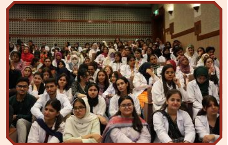
Audience at the Program

Liaquat National Hospital is honoured to have hosted this unforgettable evening, blending sport, intellect, and storytelling in a truly inspiring tribute.