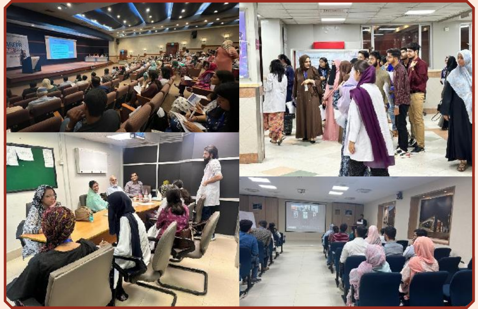
Participants at Career Fair-2025

In the second segment (11:30 AM – 1:30 PM), attendees actively participated in booth visits, where