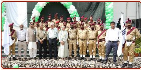
Senior Management with Security Department performed by the Liaquat National Hospital Security Department.

The ceremony was graced by senior hospital management, faculty, staff, and students, who joined together in singing patriotic songs and applauding the