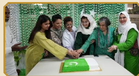
A sweet moment of pride — the ceremonial cake cutting featuring the beautiful Pakistani flag cake

It was truly a joyful and memorable day for all. The celebration not only brought happiness but also strengthened the sense of community and national pride among the members. Everyone left with smiles on their faces and hearts full of love for Pakistan.