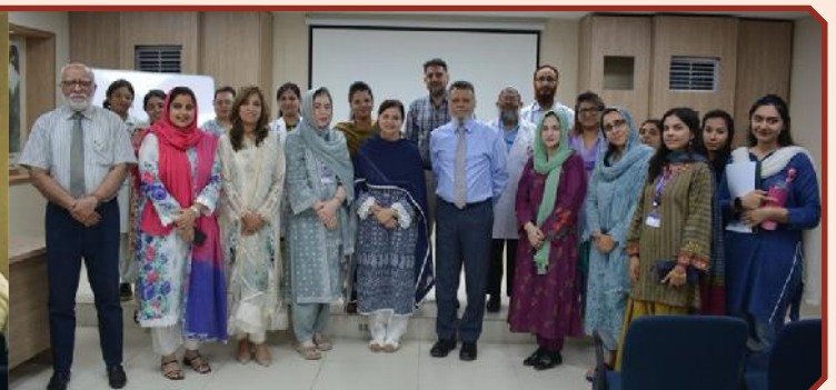
Participants at the awareness session