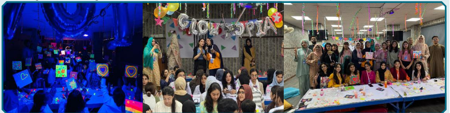
Participants at GLOWTOPIA