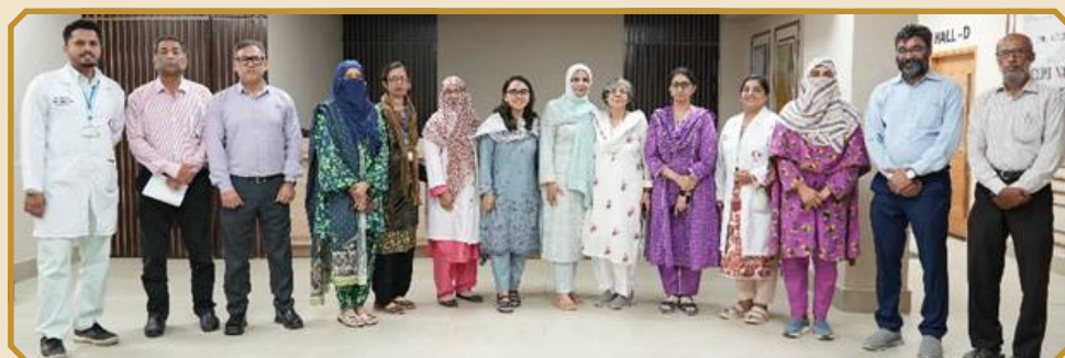
Group photo of participants

The workshop concluded with positive feedback, as participants acknowledged the relevance of AI-driven solutions and the utility of e-portfolios as a structured tool for documenting teaching excellence and professional growth.