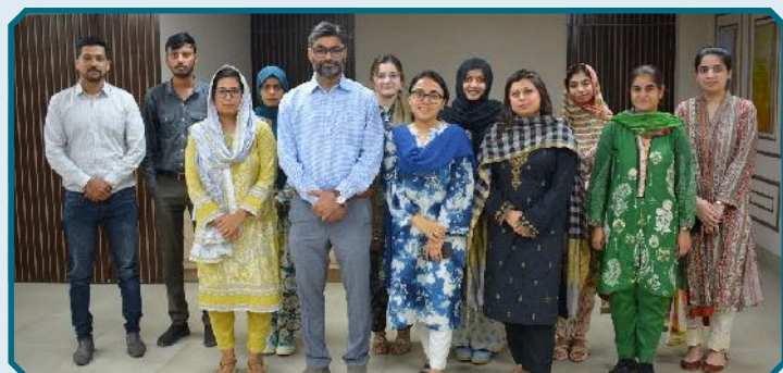
Faculty of Basic Sciences

As part of the academic mandate of the LNH Clinical Trial Unit, a structured initiative was launched to strengthen the research culture by developing digital research profiles of all LNH-affiliated faculty. This activity was planned, implemented and