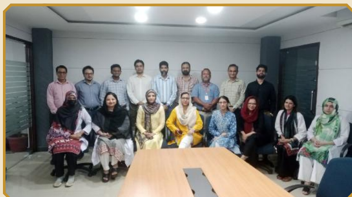
Group photo of participants at the session