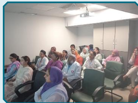
Participants at the retreat

The retreat emphasised the value of interdisciplinary nursing research in promoting proactive, patient-centred care.