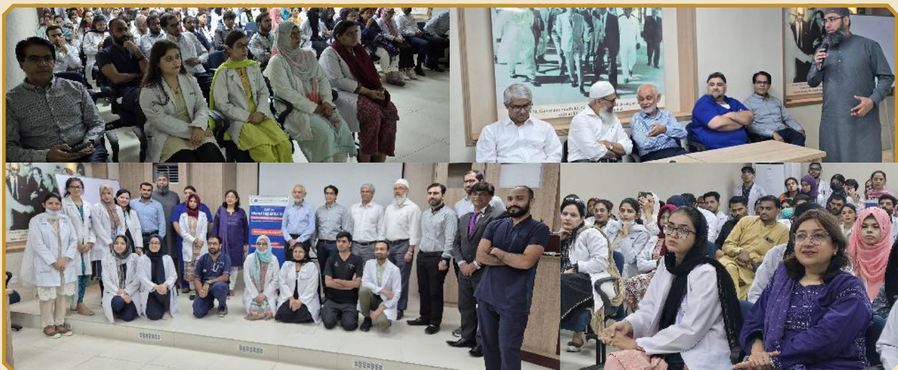
Audience with participants at the session and screening camp

Viral hepatitis affects millions worldwide, causing liver damage, cancer, and even death. In Pakistan, hepatitis B and C are significant public health concerns. This CME session and screening camp play a crucial role in raising awareness, promoting testing, and encouraging treatment. By working together, we can strive towards a hepatitis-free world. Liaquat National Hospital's initiative is a step towards addressing this critical issue and promoting public health.