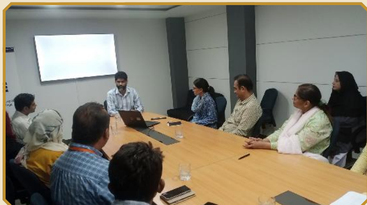
Awareness session in progress

This session underscored K-Electric's commitment to the well-being of its doctors/employees, providing them with essential knowledge to improve comfort, productivity, and long-term eye health. It was a proactive step towards creating a more health-conscious workplace environment.