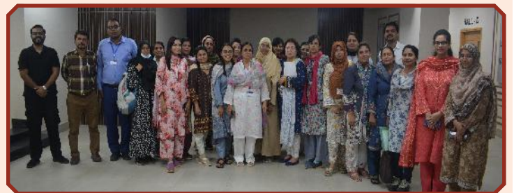
Group photo of participants at the course

training made the sessions interactive, practical, and directly applicable to professional practice. This course reinforced the importance of continuous professional development in healthcare, empowering nurse educators with evidence-based practices and updated pedagogical approaches. The program received an overwhelming response from participants and marked another step toward improving patient care and strengthening the future of nursing education.