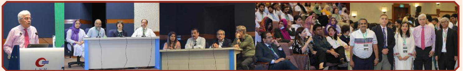
Highlights of the 7 th Pak GI conference 2025

The conference was well attended by students of the medical college, postgraduate trainees and faculty. During the conference, students participated in a Quiz competition related to the conference and won multiple cash prizes. The conference was well covered by local media and social media platforms.