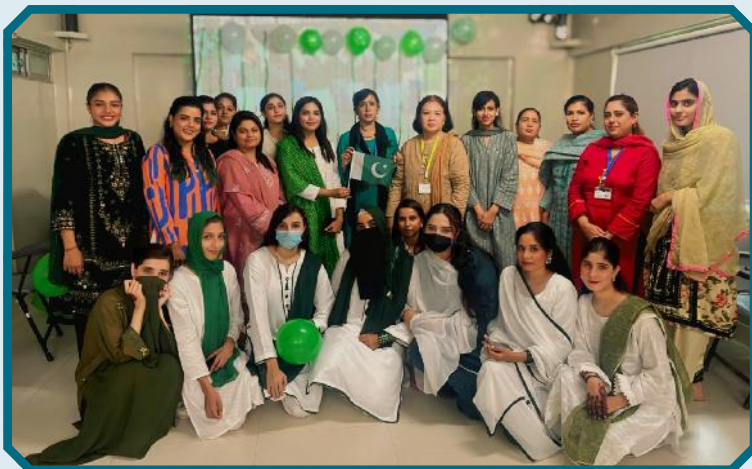
Students and faculty members at the Independence Day Celebrations