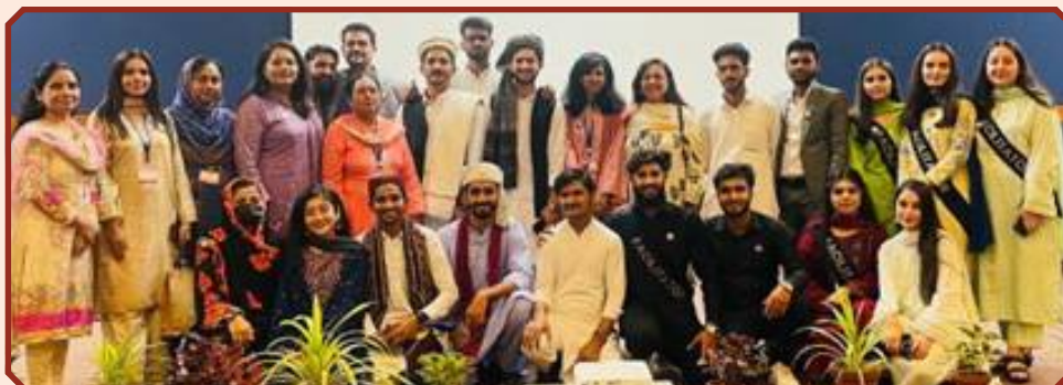
Role Play Participants with Faculty Members