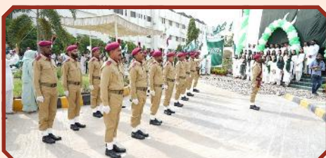
Guards in Formation