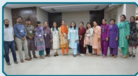
School of Nursing