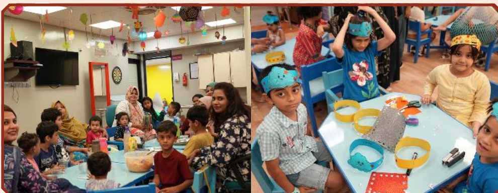
Children immerse in different activities

learn acceptance, empathy, and teamwork by engaging with peers of all abilities.