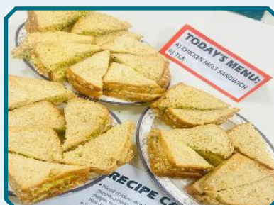
The delicious final dish paired with its recipe card — a perfect blend of flavor and learning

On 28 th August 2025, a delightful cooking session was organised at the Senior Citizens Daycare Centre, bringing together members for a fun-filled and interactive experience. The theme for the day was simple yet enjoyable - making fresh, healthy, and tasty sandwiches. The session was not just about preparing food, but also about creating moments of joy, connection, and shared memories. (continue on page 21)