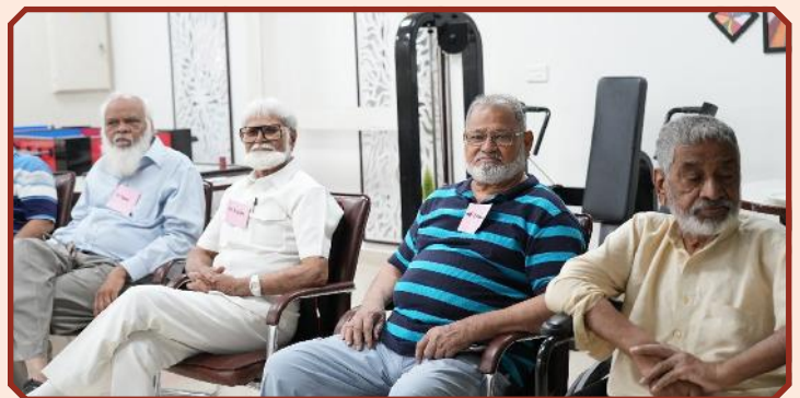
Male members actively participating and reflecting during the session — a step towards thoughtful connection

Participants explored key aspects of mindfulness, including present-moment awareness, breathing techniques, and strategies to manage stress and anxiety. The second part of the session focused on