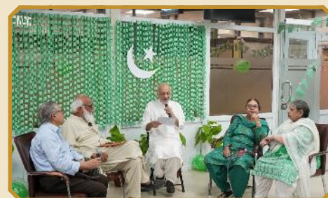
Our talented members presenting a classic Bait Bazi performance, reviving the beauty of Urdu poetry