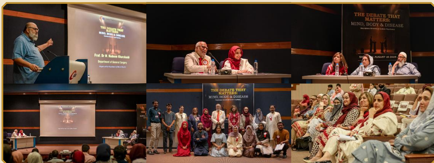
Participants at the awareness session