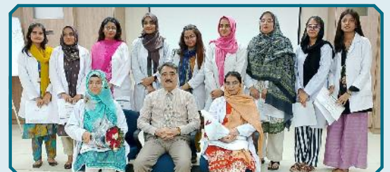
Group photo of participants