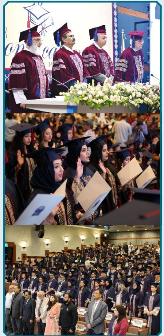
Highlights of 10 th Convocation