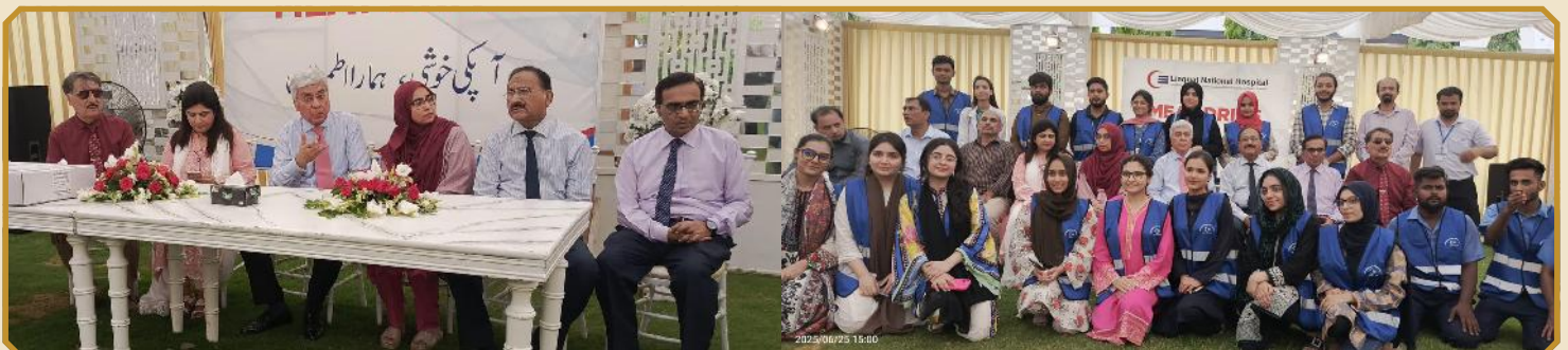
Participants and organisers at the Meat Drive