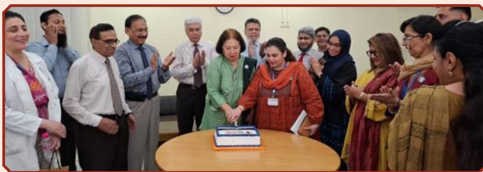
Cake Cutting Ceremony with LNH Management