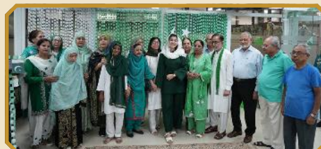
A memorable group photo of all members with the admin — capturing unity, pride, and celebration