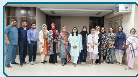
School of Physiotherapy

rapy Department and the School of Nursing. Phase 2 was implemented on 12 th June 2025. To ensure