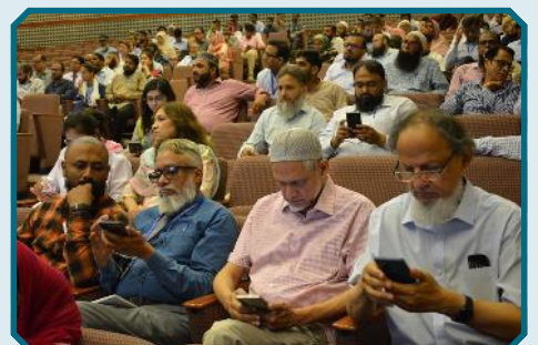
Audience at LNH Care App Inauguration