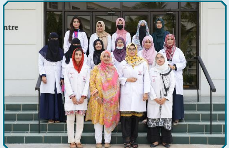
Group Photo of First Batch of Clinical Pharmacy Training Program

The first batch of trainees set a strong foundation for the program's success. Participants not only enhanced their clinical competencies but also played an active role in medication error prevention, antimicrobial stewardship, and optimisation of pharmacotherapy. Their contributions had a direct and measurable impact on patient safety and therapeutic outcomes.