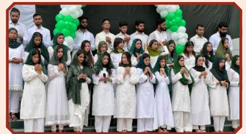
Students praying for Pakistan