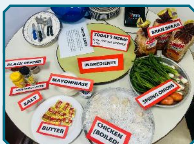
Fresh beginnings! A glimpse of the carefully selected ingredients for today's cooking session