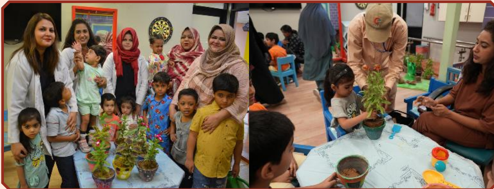
Children immerse in different activities