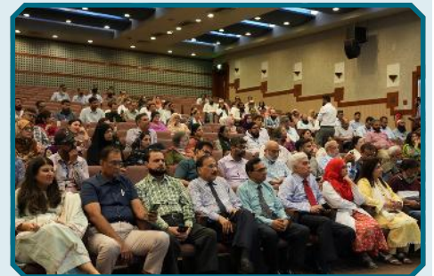
Management at LNH Care App Inauguration

The app also introduces a streamlined process for scheduling daycare surgeries, enabling patients to plan procedures with minimal hassle. Attendants can