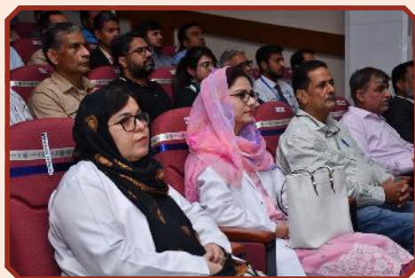
Audience at the session