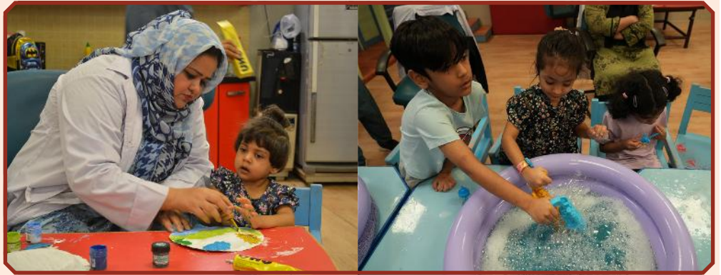
Children immerse in different activities