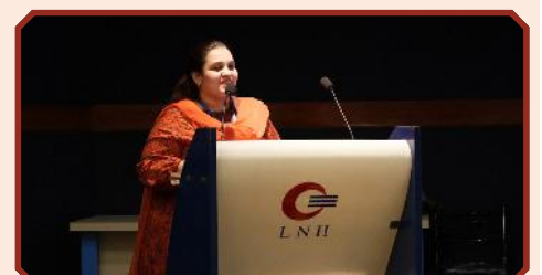
The Chief Nursing Officer presenting the overview of the IND Theme