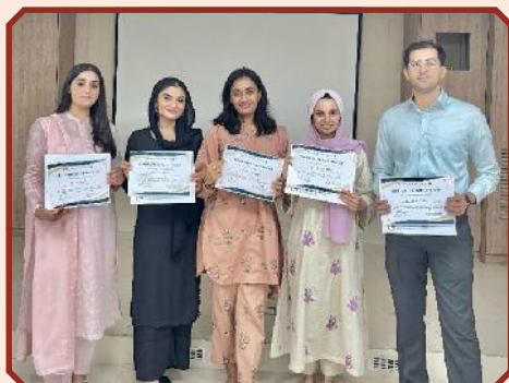
I-LEAD team group photo