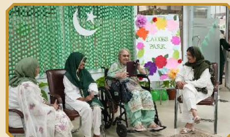
A heartfelt skit performance by our female members, reflecting creativity, patriotism, and passion

It was truly a joyful and memorable day for all. The celebration not only brought happiness but also strengthened the sense of community and national pride among the members. Everyone left with smiles on their faces and hearts full of love for Pakistan.