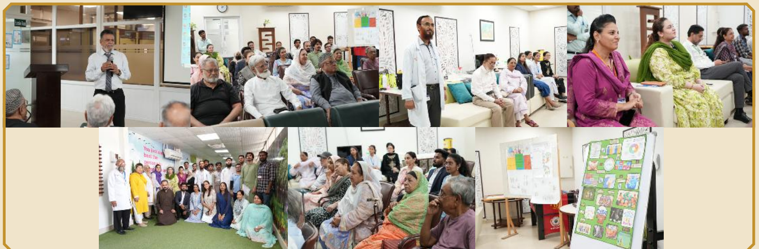
Pictorial highlights of the course