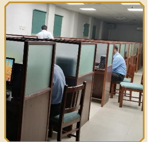
Microsoft Excel & Word Training

LNMC Administration has planned to conduct such trainings in future too during exam & summer break of students to promote a continuous growth and development culture within an organisation and empower staff to learn and grow.