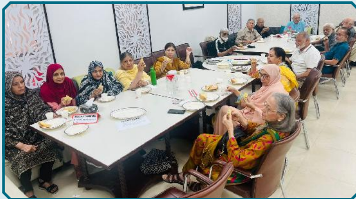
Sharing smiles and stories over a warm meal — members enjoying the fruits of their labor together

With sleeves rolled up and smiles on their faces, everyone got involved in the preparation. Some took the lead in assembling layers, while others shared tips, added their own creative twists, or told stories of their favourite childhood recipes. The atmosphere was lively, filled with cheerful chatter and laughter.