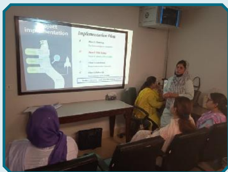
Staff giving presentation

In May 2025, the Primary Care Nursing Research Retreat was held at Liaquat National Hospital, featuring collaborative presentations by the Nursing and Family Medicine departments. The event highlighted three key research projects focused on enhancing patient safety and primary care outcomes.