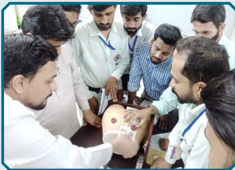
Participants in group activity

The Department of Nursing, in collaboration with the Department of General Surgery (GS), successfully conducted a one-day workshop on "Comprehensive Stoma Care: Empowering Nurses for Effective Patient Support" on 30 th May 2025. The session aimed to enhance nurses' knowledge and practical skills in stoma management, covering clinical guidelines, nutritional care, product use, complication management, and patient