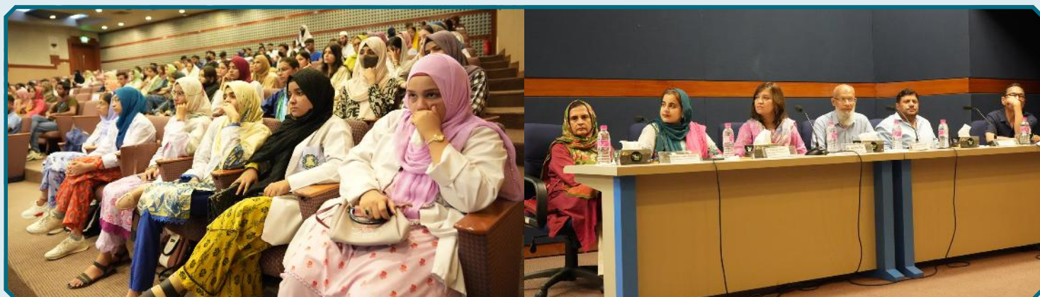
Audience with participants at the CME