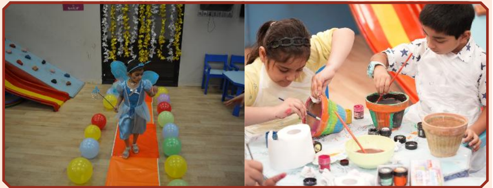
Children immerse in different activities