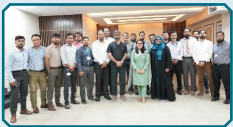
School of Physiotherapy

rapy Department and the School of Nursing. Phase 2 was implemented on 12 th June 2025. To ensure