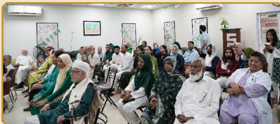
A patriotic crowd gathered in celebration — the audience immersed in the spirit of Pakistan's Independence Day